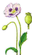
Papaver somniferum OPIUM POPPY