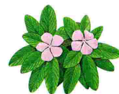
Catharanthus roseus ROSY PERIWINKLE

are more targeted. In phylogenetic surveys, researchers choose close relatives of plants known to produce useful compounds. In ecological surveys, they select plants that live in particular habitats or that display characteristics indicating they produce molecules capable of exerting an effect on animals. Collectors might, for example, focus on specimens that seem to be immune from predation by insects. The absence of predation suggests a plant may produce toxic chemicals. Many chemicals that are toxic to insects also show bioactivity in humans, which means they might be capable of achieving some therapeutic effect.