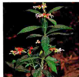
Rauvolfia serpentina INDIAN SNAKEROOT