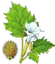
Datura stramonium JIMSON WEED