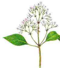
Cinchona pubescens FEVER TREE