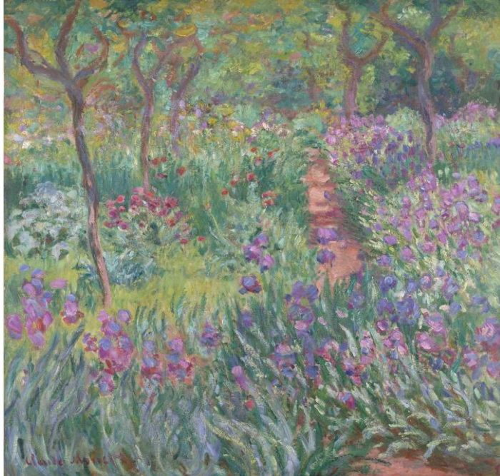
Claude Monet, The Artist's Garden in Giverny Yale University Art Gallery, Collection of Mr. and Mrs. Paul Mellon, B.A. 1929

The exhibition in the Rondina Gallery of the Botanical Garden's LuEsther T. Mertz Library will communicate Monet's personal engagement with his gardens as well as their intimacy and richness. One of the two Monet paintings on view depicts the iris garden at Giverny from the Yale University Art Gallery, capturing the intensity of the flower garden's colors, and the other from a private collection in Switzerland, depicting a dense arrangement of irises with such vitality as to leave no doubt about Monet's complete devotion to botanical affairs. The two are ideally paired and have never been displayed together in any exhibition. Also on view will be one of Monet's own paint palettes, on loan from the Musée Marmottan Monet in Paris. The palette was used to create his art, with colors on its surface similar to those visitors will see on his paintings hanging nearby.