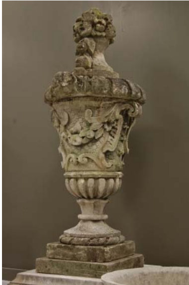
A monumental 18th-century urn. Offered by New England Garden Ornaments.

Located at the entrance to the Antique Garden Furniture Fair , a Garden Room features a Specialty Plant Sale with an extensive selection of unusual, colorful plants representing some of horticulture's finest growers. A variety of shrubs and trees, including Japanese maples, Itoh peonies and other perennials, as well as annuals and herbs will be available.