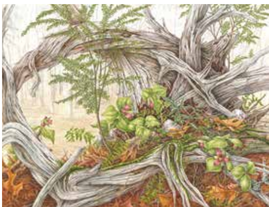
Betsy Rogers-Knox, Renewal—Eastern Hemlock , 2017. Tsuga canadensis Mary Flagler Cary Arboretum, Millbrook, New York, watercolor on paper, 19 x 26-1/2 inches

Botanical art possesses a unique power among fine art forms to educate about plants and promote ecological awareness. The pieces in this exhibition are beautiful, but their beauty resonates for much longer than the time we spend looking at them. The artistry with which each specimen is rendered inspires us to take greater notice of the awe-inspiring qualities of the trees around us. A hawthorn or magnolia might draw our focus when in flower, but the botanical artist sees more: a gnarled root, the rainbow hues of lichen, or the cherry-red clusters of seeds. Out of the Woods captures these small moments of natural wonder.