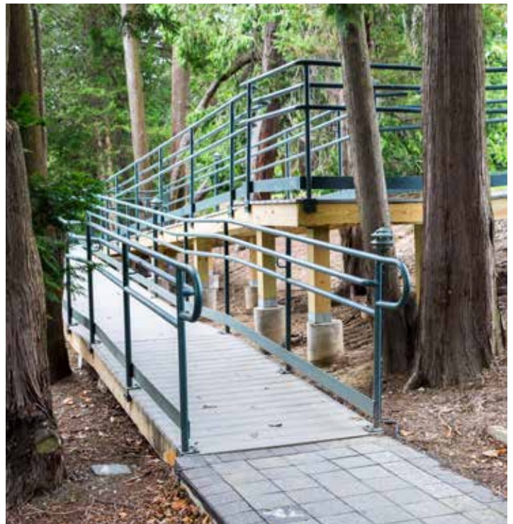
New ADA ramp behind the Enid A. Haupt Conservatory