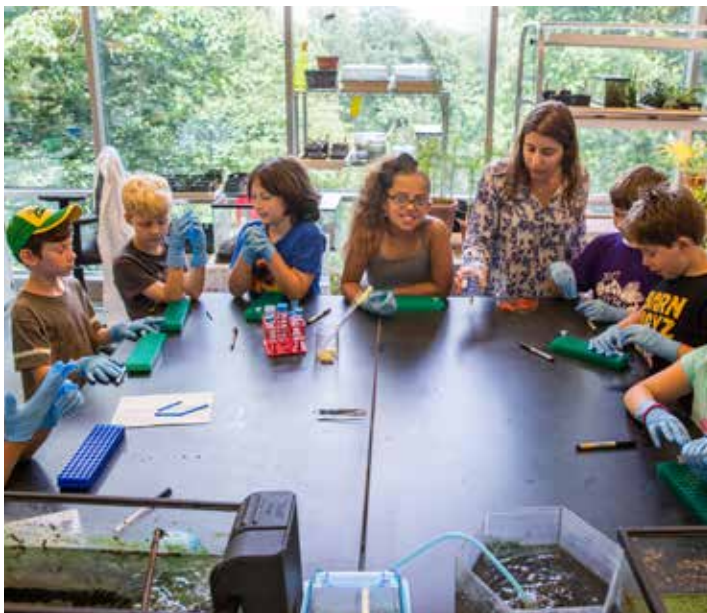
Plant Explorers Science Campers in the Pfizer Plant Research Laboratory

I am pursuing an undergraduate degree in Developmental Psychology. I think right now that I will get a Master's Degree in Early Childhood Education, which certifies me to teach through second grade. I am a Senior Explainer but was also a Camp Explainer this past summer. I get to see first-hand what is involved in creating lesson plans and managing a classroom for seven hours each day. The opportunities and experiences offered in the Explainer Program have helped change my life.