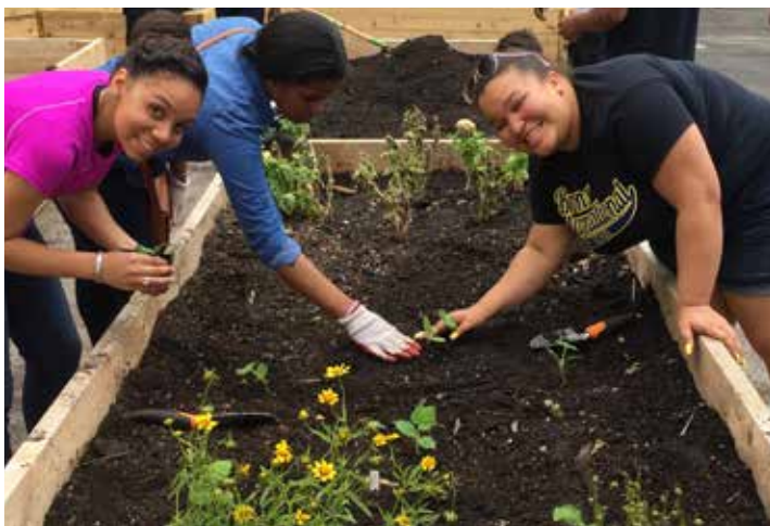
High School students planting vegetable starts at Morris Campus Farm