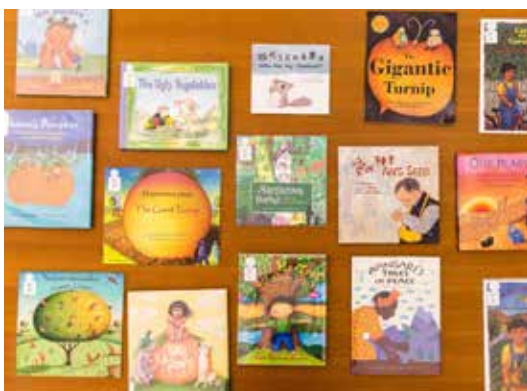
New children's books in the LuEsther T. Mertz Library

The Mertz Library will continue to seek out titles that offer diverse perspectives of the natural world for our youngest visitors.