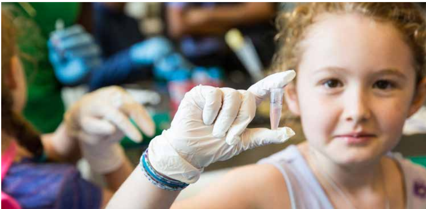
NYBG programs provide hands-on experiences that inspire and engage Bronx youth in a wide variety of scientific exploration and discovery.