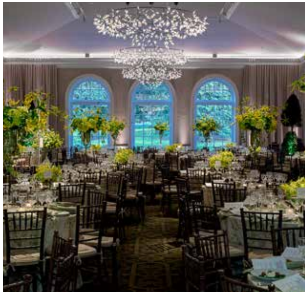
Garden Terrace Room

The Garden is an ideal location for corporate entertaining, with exceptional catering provided by STARR Events. The grounds offer stunning venues: the Enid A. Haupt Conservatory, Peggy Rockefeller Rose Garden, Garden Terrace Room, Lillian and Amy Goldman Stone Mill, Watson Education Building Classrooms, and Arthur and Janet Ross Lecture Hall.