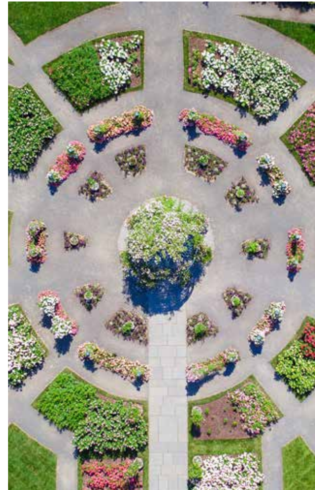
Peggy Rockefeller Rose Garden