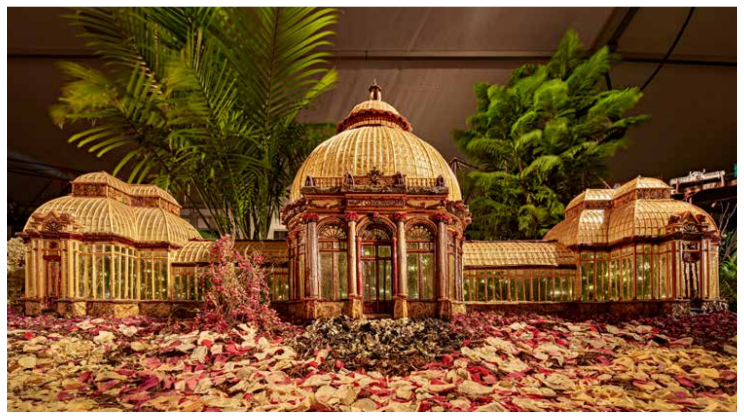
New York Botanical Garden's Enid A. Haupt Conservatory recreated in the Holiday Train Show®