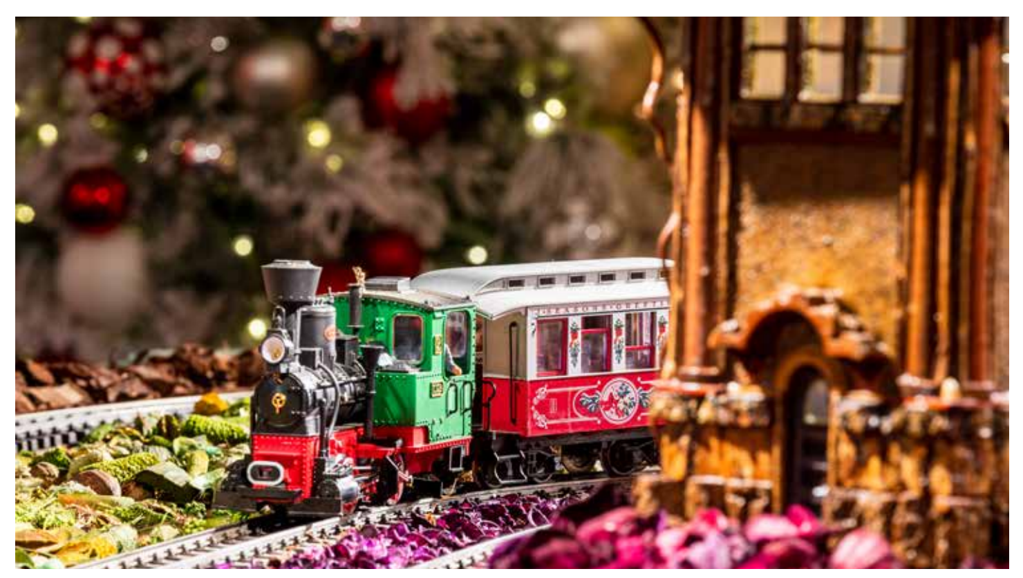
Model Train in the Holiday Train Show®