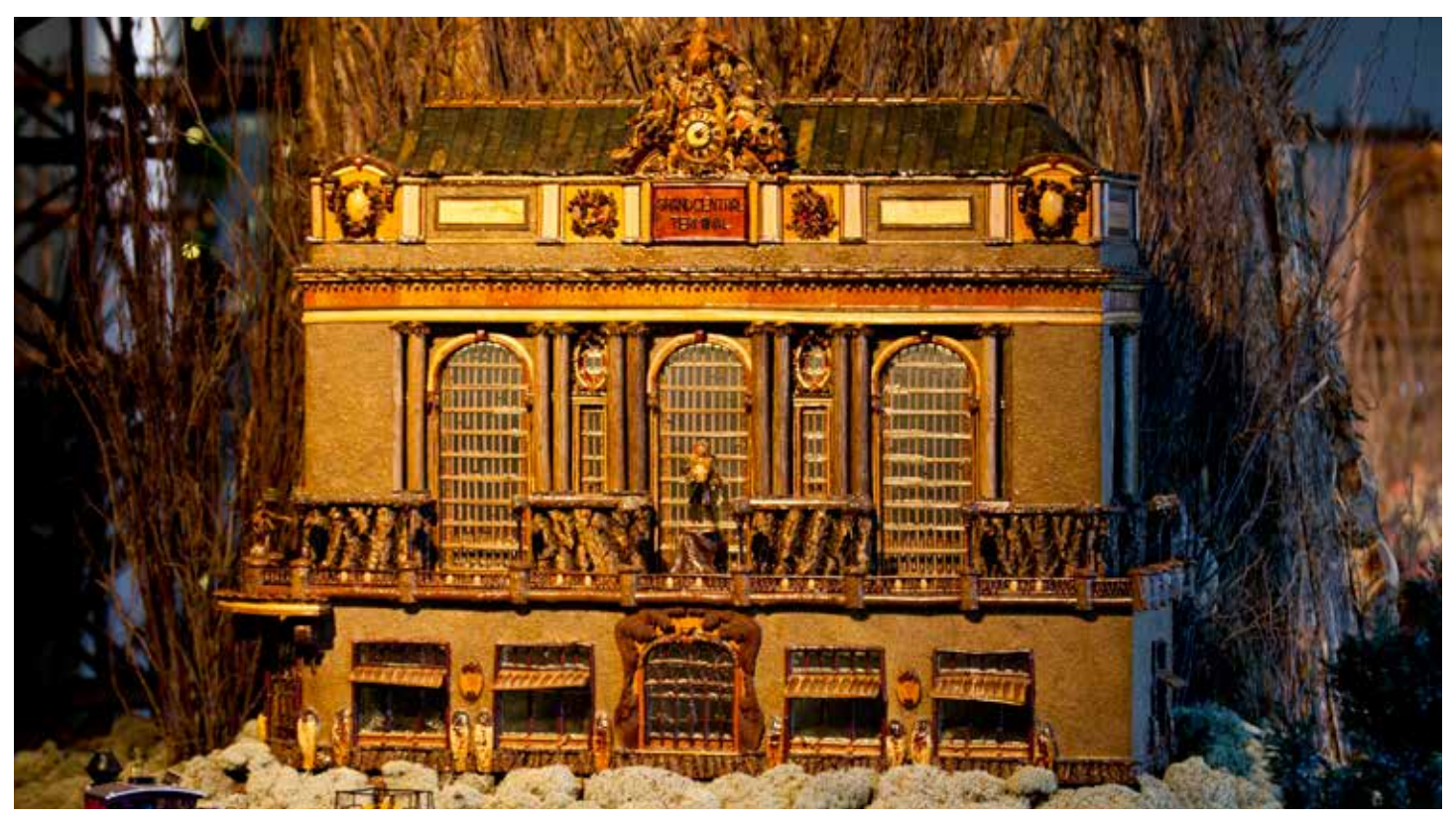
Grand Central Terminal recreated in the Holiday Train Show®