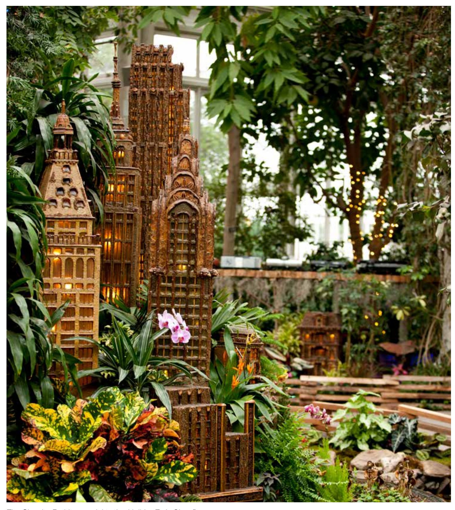
The Chrysler Building model in the Holiday Train Show®