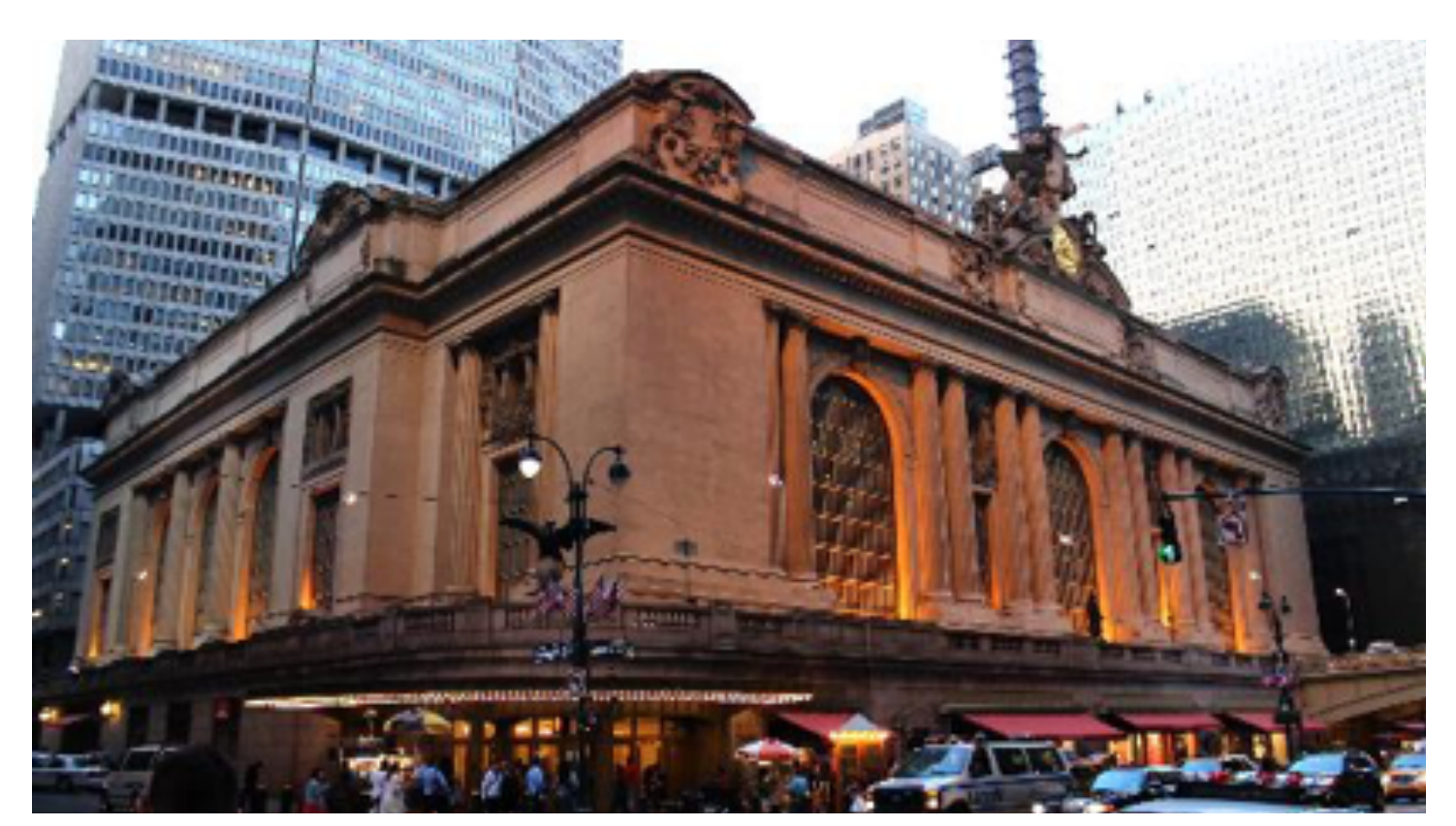
Grand Central Terminal, New York City