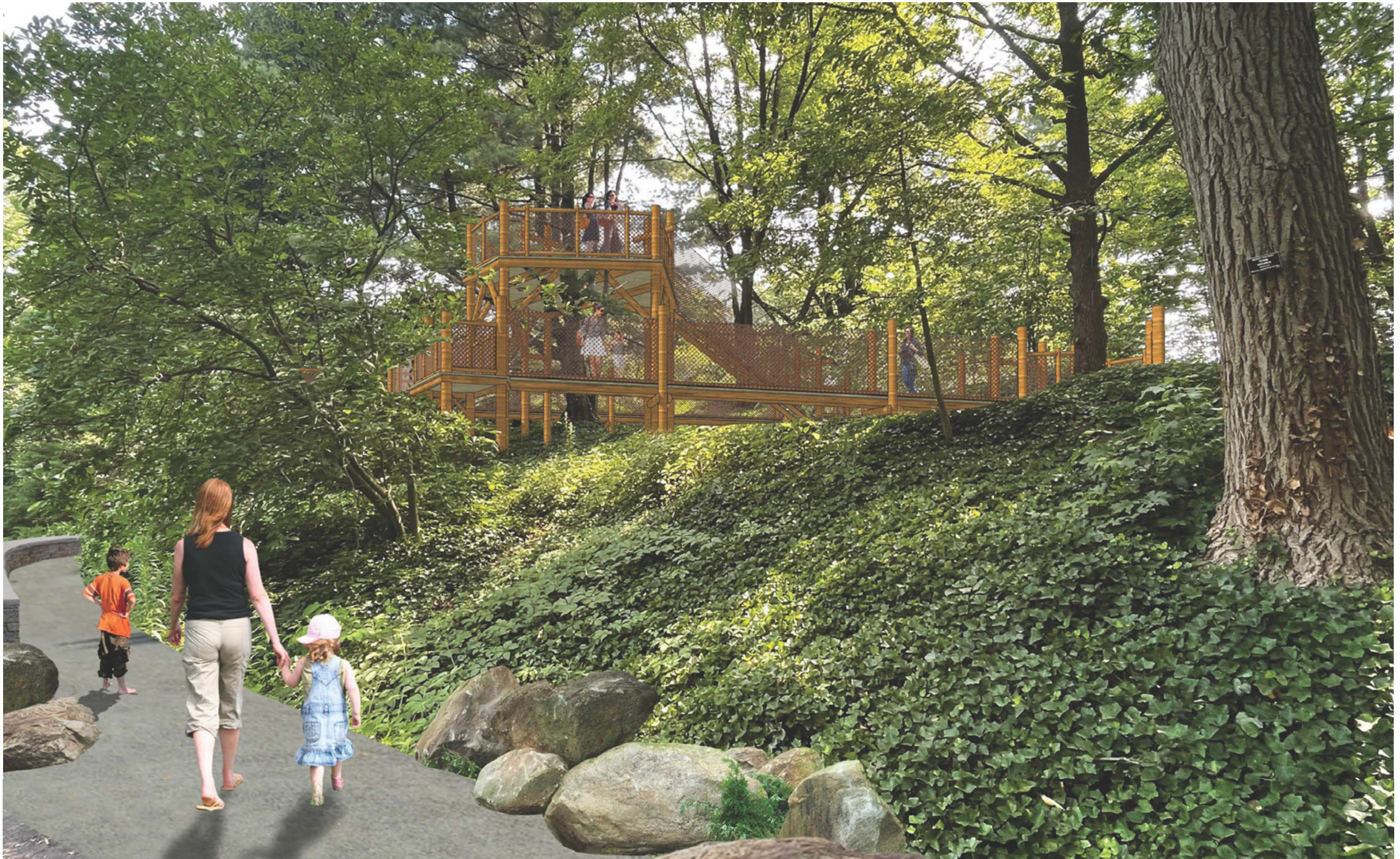
Rendering of Treetop Walk in Evergreen Hideaway