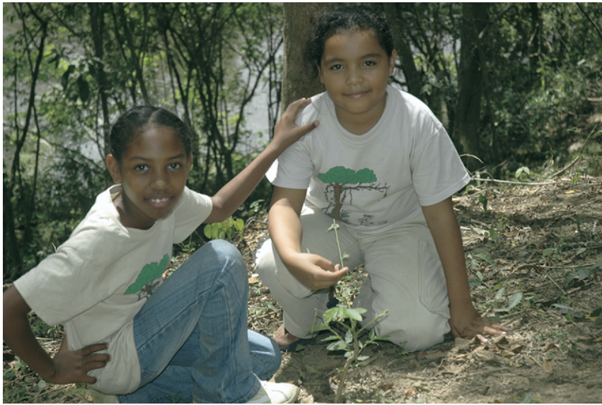
Children at the Bush Medicine Camp in Belize proudly show a visitor the tree they have planted. As the Chinese proverb says, “one generation plants the tree; another gets the shade.”

had information about the plants they used for healing. Some were about plastic surgery because the Mayan people performed plastic surgery to cure different problems. Beginning in the 1490s, all of that knowledge shifted from a written tradition that was recorded by the H'men and their scribes to an oral one. So mother would take daughter out beyond earshot of the Spanish soldiers and teach her what she needed on her path to womanhood, or father would take son into a cave and explain the plants that the son would need to raise his family.