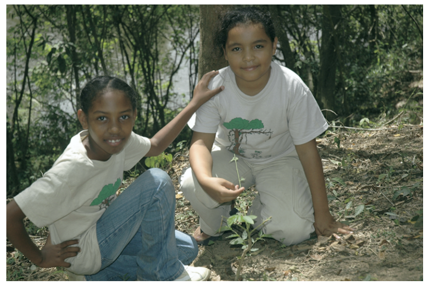
Children at the Bush Medicine Camp in Belize proudly show a visitor the tree they have planted. As the Chinese proverb says, "one generation plants the tree; another gets the shade."

had information about the plants they used for healing. Some were about plastic surgery because the Mayan people performed plastic surgery to cure different problems. Beginning in the 1490s, all of that knowledge shifted from a written tradition that was recorded by the H'men and their scribes to an oral one. So mother would take daughter out beyond earshot of the Spanish soldiers and teach her what she needed on her path to womanhood, or father would take son into a cave and explain the plants that the son would need to raise his family.