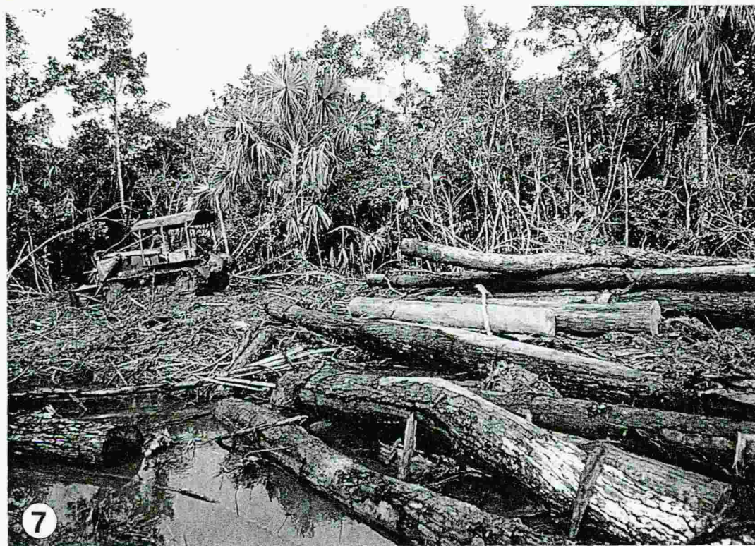
6. Schippia concolor in subtropical moist forest habitat at base of Mountain Pine Ridge. (Photo by M. Balick.) 7. Destruction of Schippia concolor habitat along the Western highway. Pine trees are being logged out. (Photo by M. Balick.)