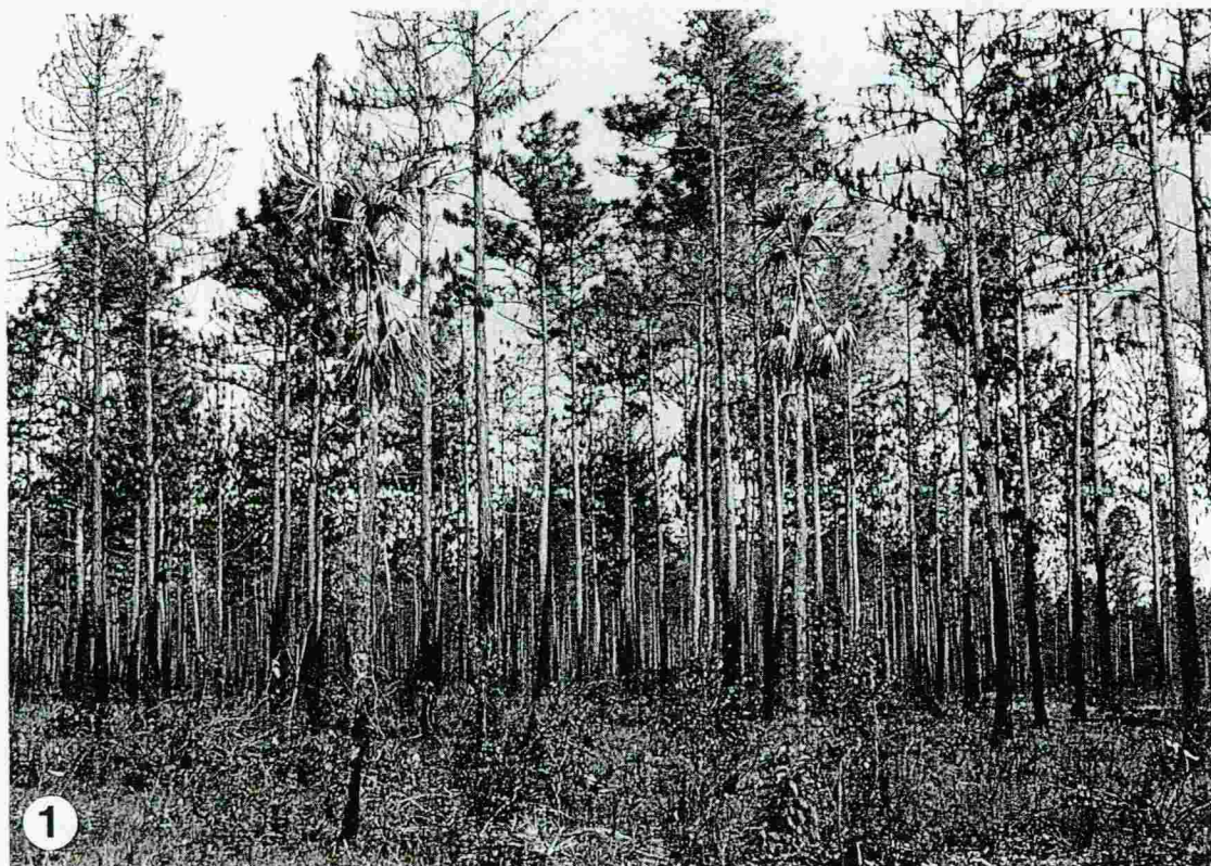
1. Habitat of Schippia concolor in the pine forest of St. Augustine.

evidence of Schippia . Therefore, distribution of S. concolor in Guatemala cannot be proven. We consider the palm endemic to Belize.